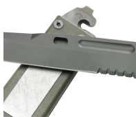
DIAMOND STONE FOR SHARPENING