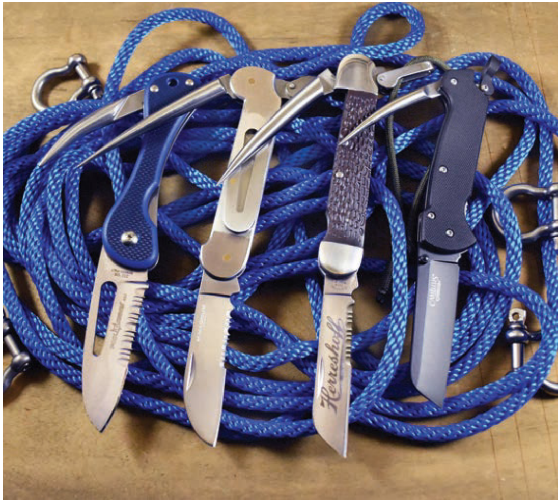
Down to the sea with marlinespikes, from left: the Fox Sailing Knife, Boker Magnum Catamaran, Colonial Marlin Spike and Camillus Marlin Spike.